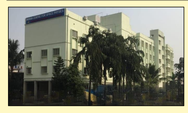
Main building of ICSP on Eastern Bypass

https://youtu.be/u01IE4UEntU?si=cpodrJLQE11TiFcN